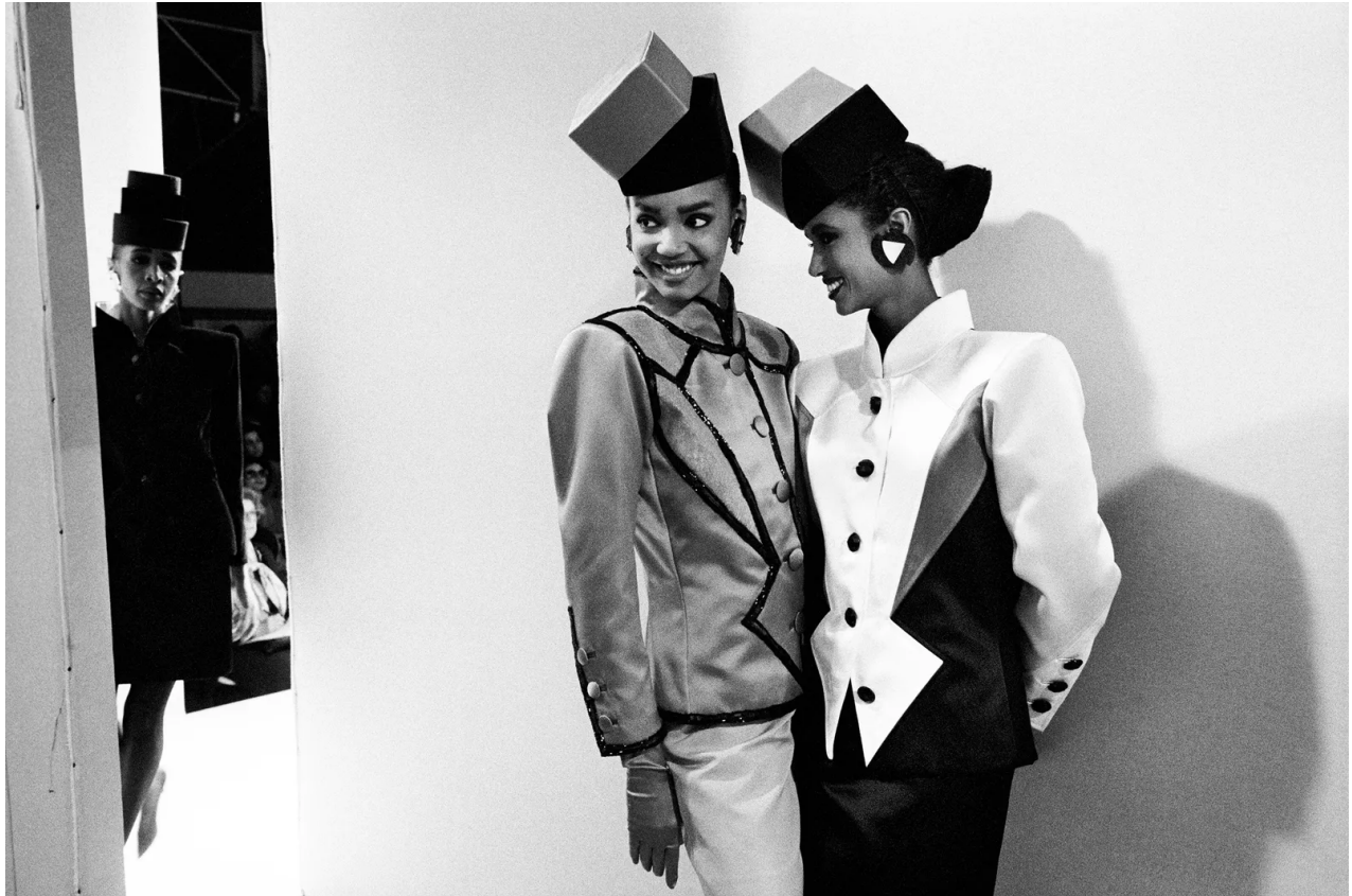
Yves Saint Laurent