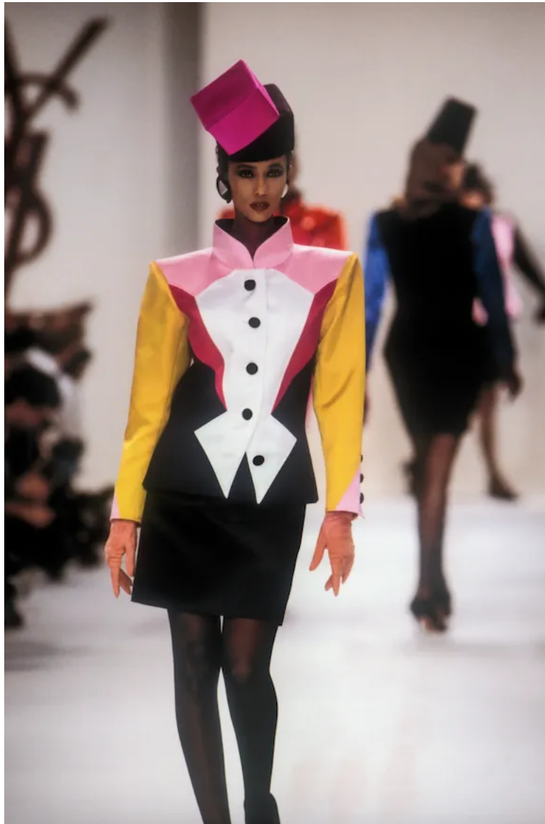
Yves Saint Laurent